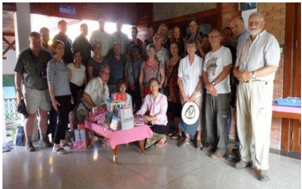
Doctors-on-Tour – South East Asia