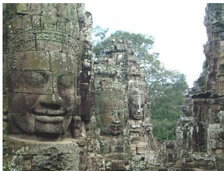
Bayon, Angkor Thom