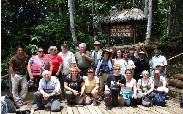
Doctors-on- Tour – Ecuadorian Amazon