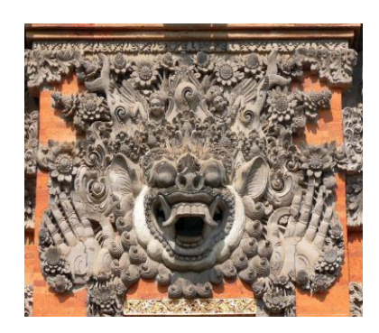
Day 6 – July 5 (Thu) – Ubud – Royal Family & Udayana University (B,L)